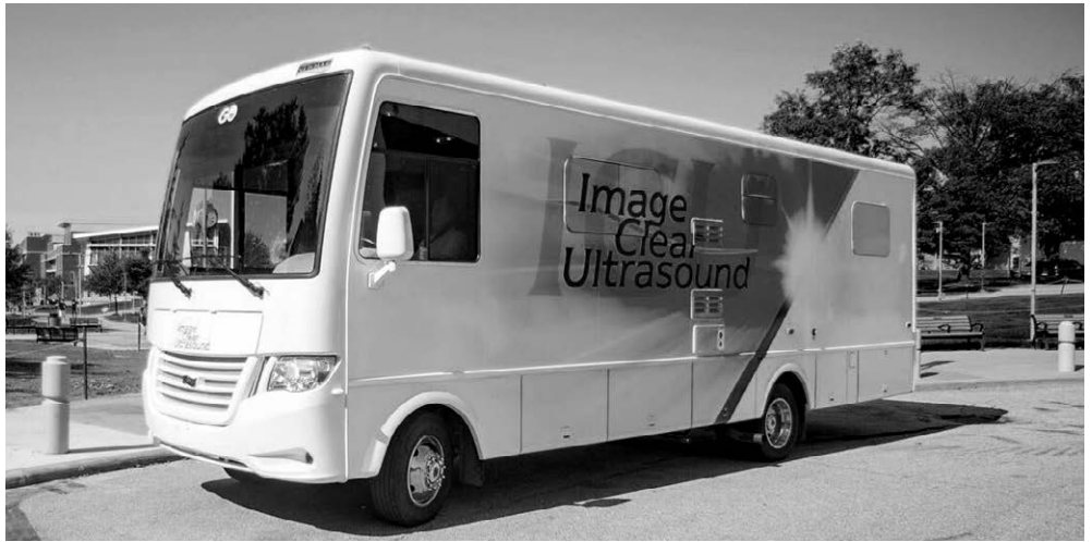
We truly value your partnership and investment in Options. And we're eager to see how God will use the Mobile Clinic to save lives.

The exciting news is roughly 2/3 of the cost to purchase our own mobile clinic has already been raised! More exciting news