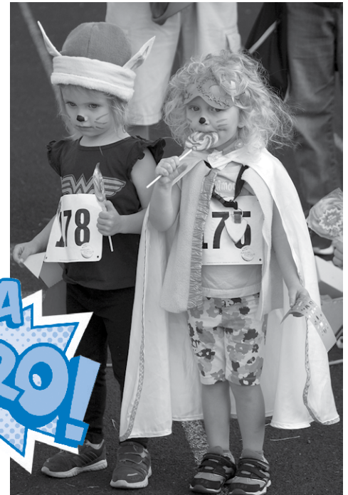
The Family Fun Day will replace the Walk Run Dash for Life. All Superheroes are invited!